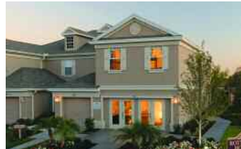
TAMPA – Sabal Pointe Townhomes 4052 Bismarck Palm Drive 2 BR + Loft / 2-1/2 BA / 1 Car 813-626-6886 NOW $120,990