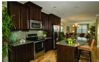
TAMPA – Pelican Pointe Townhomes 6215 Anhinga Place 2 BR + Den / 2-1/2 BA / Tandem GAR 813-854-5754 NOW $199,900