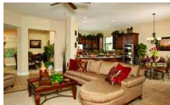
CLEARWATER – Reserve Single Family 2668 Third Avenue S 4 BR + Den / 3-1/2 BA / 3 Car 727-799-6479 NOW $459,900