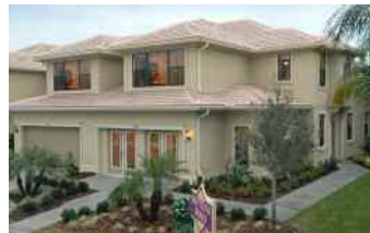
LARGO – Beacon Trace Townhomes 12606 San Blas Loop 3 BR + Loft / 2-1/2 BA / 2+ Car 727-595-3462 NOW $239,900