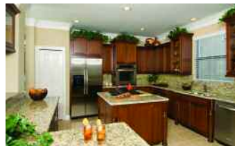
CLEARWATER – Reserve Single Family 2683 Third Avenue S 4 BR + Bonus Room / 3-1/2 BA / 3 Car $727-799-6479 NOW $549,900