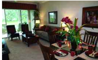
TAMPA – Sabal Pointe Townhomes 4050 Bismarck Palm Drive 2 BR + Loft / 2-1/2 BA / 1 Car 813-626-6886 NOW $119,900