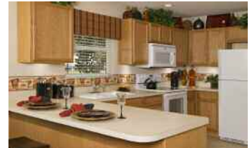
VALRICO – Oakwood Terrace 2906 Mojave Oak Drive 2 BR + Loft / 2-1/2 BA / 1 Car 813-655-3195 NOW $124,410