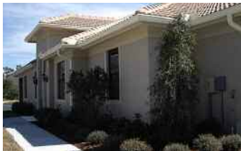
PALM HARBOR – Tarpon Ridge Villas 4819 Michelle Lane One-Level Villa / 2 BR / 2 BA / 2 Car 727-937-0439 NOW $179,900