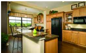
SEMINOLE – Hidden Bayou Townhomes 7583 Caponada Boulevard 3 BR + Den / 2-1/2 BA / 3 Car 727-398-7170 NOW $329,900